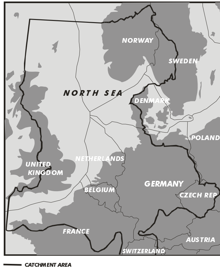
Figure 2 North Sea Catchment Area