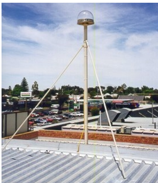
Figure 2: GPSnet Mildura

Ideally the GPSnet base station coordinates would be referenced directly to the AFN so that there is good agreement with the national framework. However, due to the sequential adjustment of GDA94 from the AFN down to the low order control there is generally a centimetre-level bias in the local ground control when compared to coordinates derived directly from the AFN. In some parts of the state this difference is 1-2cm and in others it is up to 15cm (Dawson, 2001). By referencing the GPSnet base stations to nearby ground control the local consistency of the datum is maintained. In time these biases, which are a legacy from traditional surveying methods, will be eliminated with the introduction of more satellite-based measurements into the datum realisation. In the meantime surveyors use ground control to verify base station coordinates and to fit constrain their results to the superseded reference frame AGD66. This datum is still used and will continue to be until all data sets are transformed to the new datum.