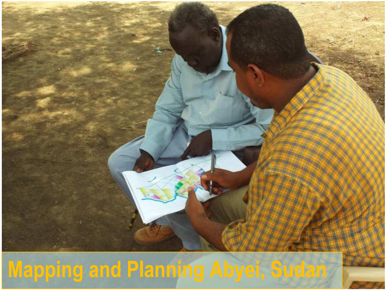
Mapping and Planning Abyei, Sudan