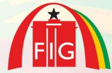
FIG Working Week 2024