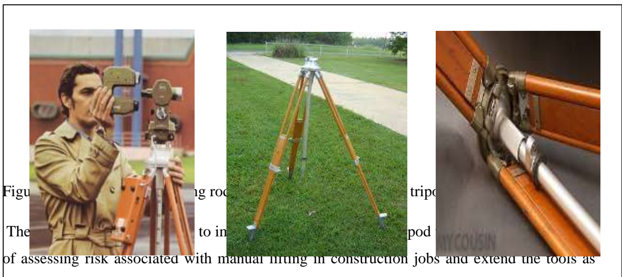
Figure 1. Using rod to measure the height of the instrument. The graduated tripod is used to measure the height of the instrument. of assessing risk associated with manual lifting in construction jobs and extend the tools as some first aid instructions which are equivalent with those available from land surveyor's social experts.

To modify the normal tripod to a graduated tripod, approximately one meter of the tape should be glued to the side of every single leg of the tripod or using a graduated centering rod for centering the instrument over a station and measure the height of the instrument (HI) see the attached pictures for using a graduated centering rod for setting up the instrument over a ground station and measuring the height of the instrument was designed by Kern of Aarau, Switzerland (line of sight)( Abby, D.G., 1965 ; Rüeger, J.M. and Brunner, F.K., 1981).