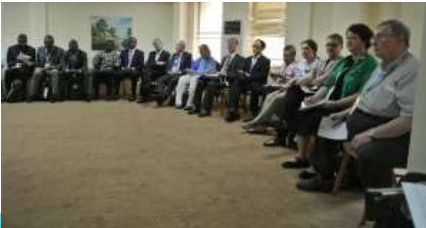
FIG Presidents' Meeting , Abuja, 2013

SINCE 2002 I AM DELEGATE TO COMMISSION 6 AND SEVERAL TIMES DELEGATE OF THE COLLEGE OF GEOGRAPHICAL ENGINEERING