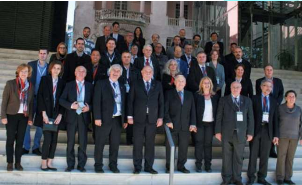
FIG C3 Annual Meeting & Workshop