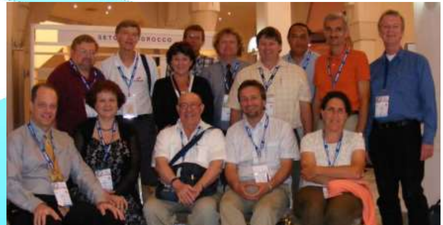
Standards Network Meeting, Marrakech, 2011