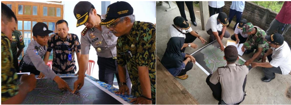
Figure 2 Coordination in Ngampel Village for IP4T implementation