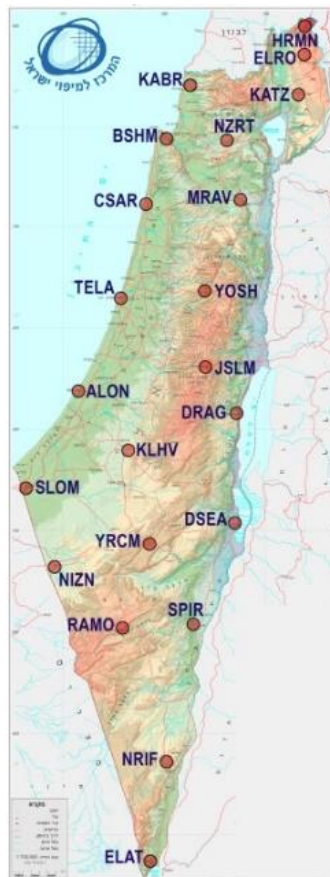
Figure 1: The primary horizontal control in Israel is a network of 22 CORS

Further details about occupation time, difference between survey stations and so on are provided by the Director General Instructions, these are comparable to Caltrans 2012.