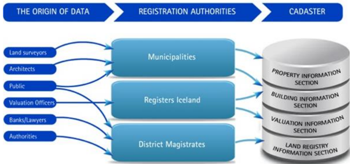
Picture 1. Origin and type of information in the cadastre

The Land Registry Information Section contains information on the legal owner of a property and other right holders, as well as mortgages and other encumbrances. The districts commissioners' registration is based on the description of the property in the property information section. The district magistrate enters information into this section of the land register.