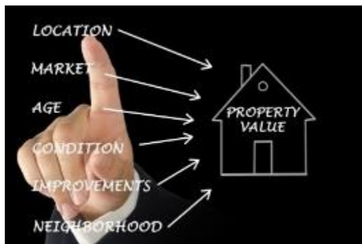
Picture 2. Indicators of Property Value

RI is currently finalizing new methods for commercial real estate. These new methods are based on the income approach, and will transform the appraisal of commercial real estate leading to much fairer appraisals and also give appraisers better tools to work with.