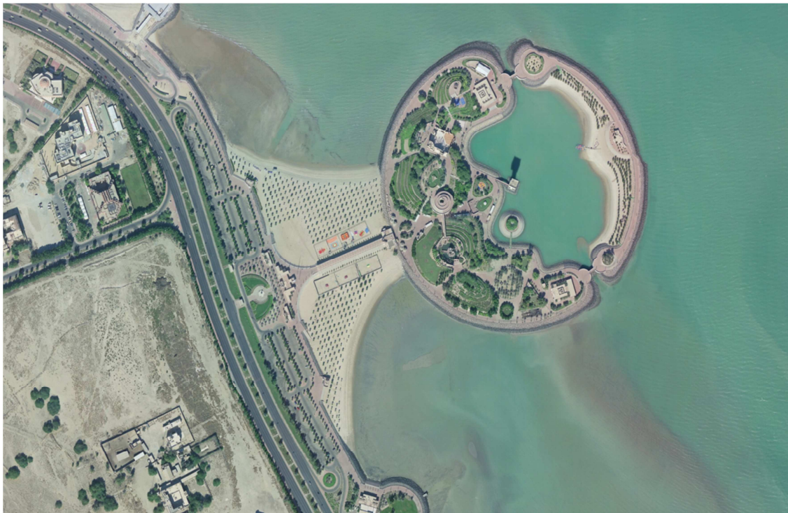
Figure 2: Color Ortho-photo showing the study site of Green Island public beach (year 2004, scale 1/2000)