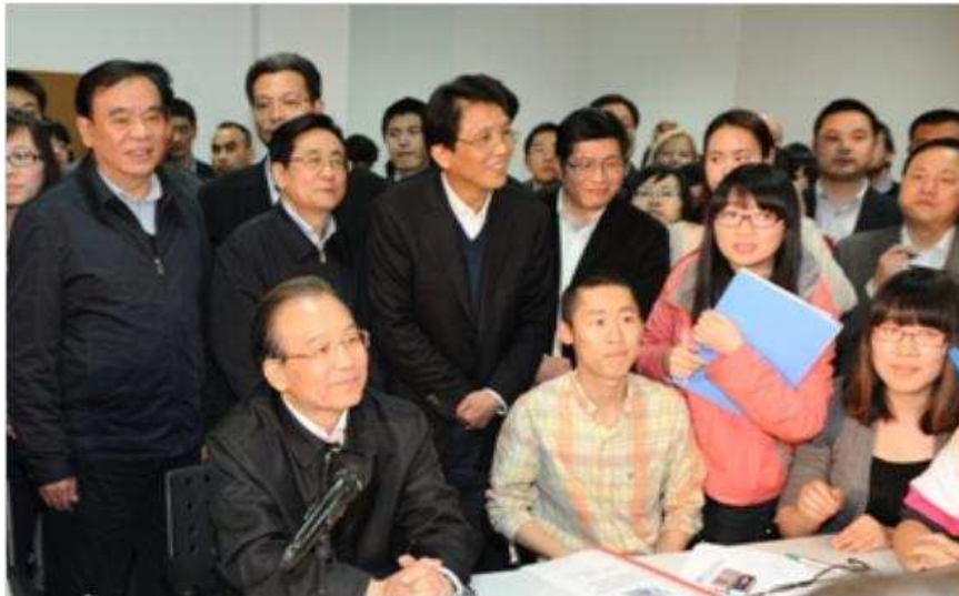
Figure 3, Premiere Wen JiaBao visiting UNNC in April 2011.

There is also a lot of interest and support for UNNC from the Chinese governments, at local and national levels. UNNC is always supported by the Ningbo Bureau of Science and Technology as well as the Bureau of Education. In addition to this, many senior figures have been to UNNC, including Premier Wen JiaBao, The Minister for International Affairs, The Minister for Science and Technology to name a few.