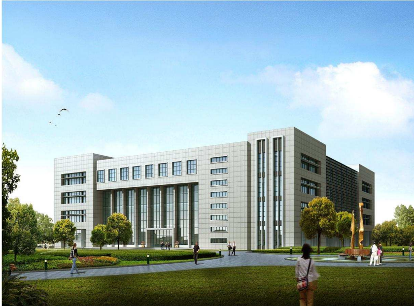
Figure 4, The New Science and Engineering Building.