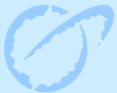
FIG Working Week 2011, Marrakech