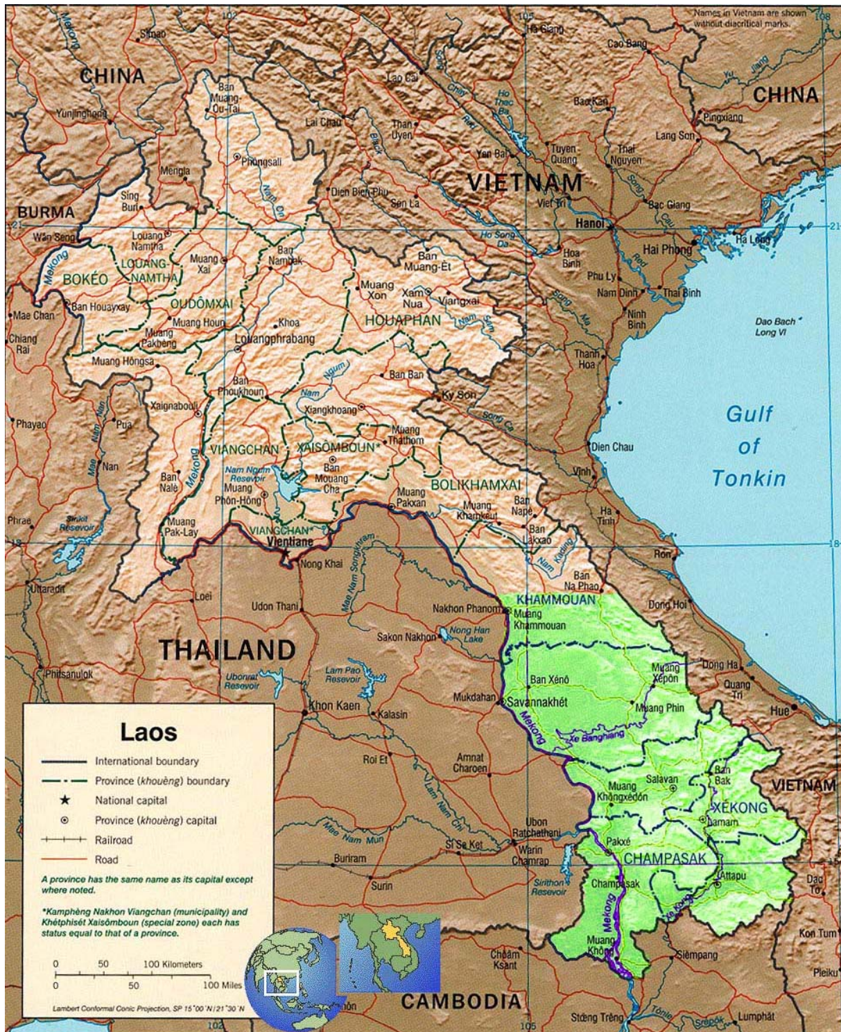
Figure 1. Map of Laos with mapping area of SNGS highlighted with green colour.