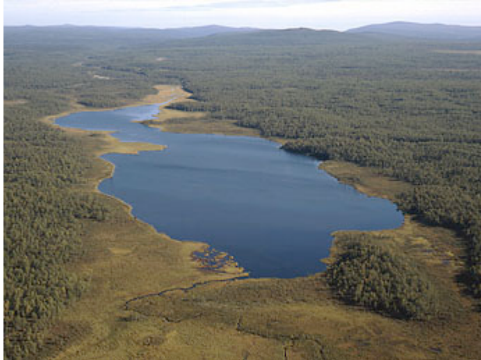
Picture 2. Lemmenjoki National Park in Finland: forest, peatland, lake and mountains.

There are four really different seasons in Finland. The temperature varies from – 30 degrees to + 30 degrees Celsius in the Sámi homelands. The growing season lasts about 110 days and the soil is barren. Climatically, the area is part of the boreal zone. There is Arctic light and the sun does not set for 2.5 months in the summer and it does not rise for 2 months in the winter. The Sámi homeland is covered by forest, peatlands, mountains and lakes.