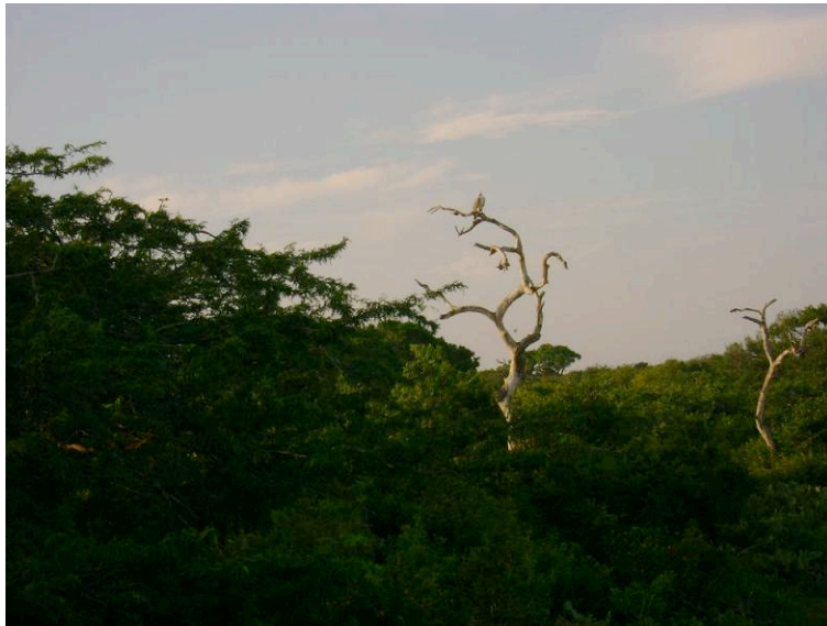
Picture 3. Jungle in the south-eastern part of Sri Lanka.

The Veddha people have an unwritten Veddha language and a chieftain as their leader. One of the sons of the chieftain will become the next chieftain. The chieftain has good personal relationships with the Sri Lankan leadership and the media.