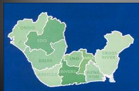
FIGURE 1.1 NIGER DELTA MAP SHOWING ALL THE STATES WITHIN THE REGION