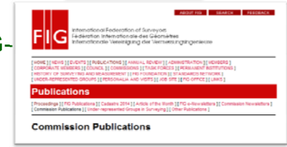
COMMISSION 2 – Workshop Vienna, 26-28 Feb. 2009