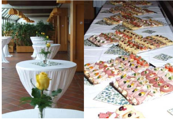
COMMISSION 2 – Workshop Vienna, 26-28 Feb. 2009