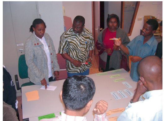
Box. 3: Example of a learning exercise in step 2. Description of students' experiences.