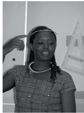
One of the Kenyan students explaining her traditional ornaments, NRM Module 1, 2007

Box. 2: Example of a learning exercise in step 1. Initial expectation and readiness.