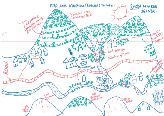
Example of Village Sketch Map, by Rhoda Nyaribi, Participant NRM Module 1, 2005.