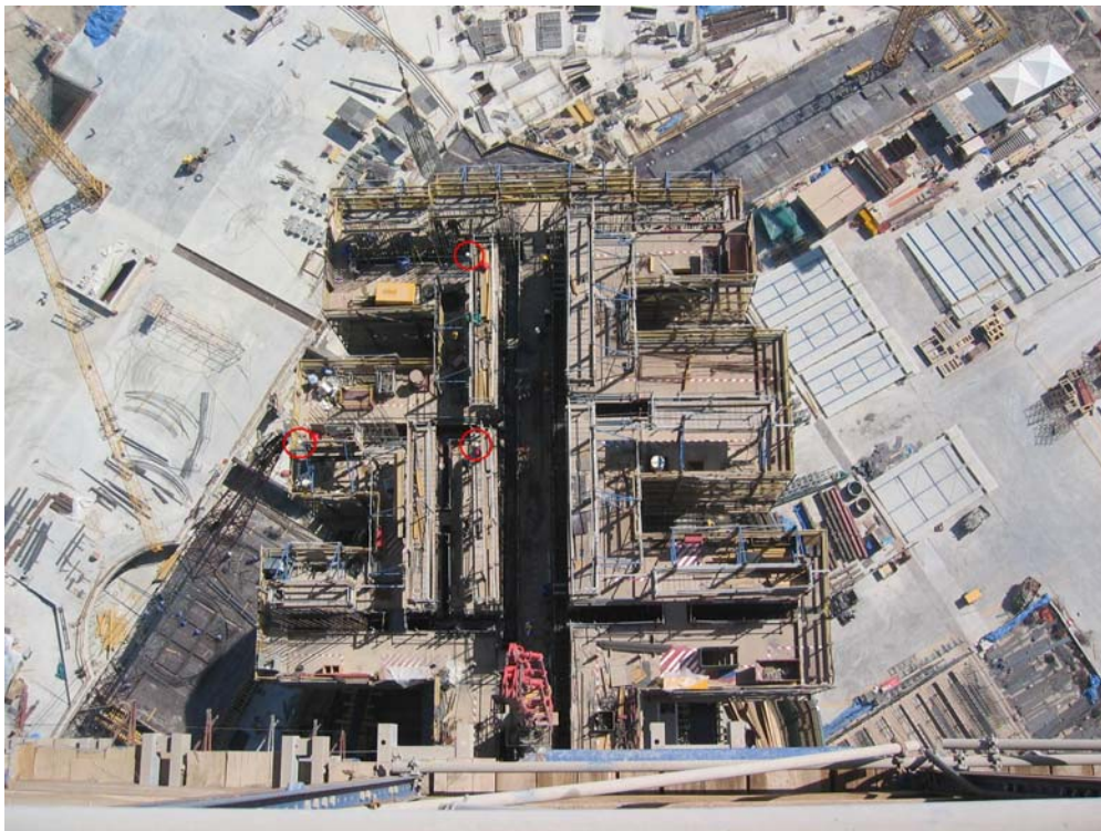
Figure 3: GPS active control points

To remove that restriction it will be necessary to consider this instrument as a local 3D axis system. The coordinates computed by using the observations (directions and distance) are internally consistent but must be transformed into the reference frame defined by the set of GPS antennas. In our case as we use a single total station, the problem is simply a 3D transformation also known as similarity transformation or Helmert transformation.