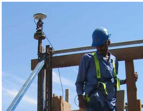
Figure 1: GPS and circular prism collocated

A tiltable circular prism is placed below each antenna and a Total Station instrument (TPS) is set up on the concrete visible to all GPS stations. The GPS plus TPS comprises a "measurement system".