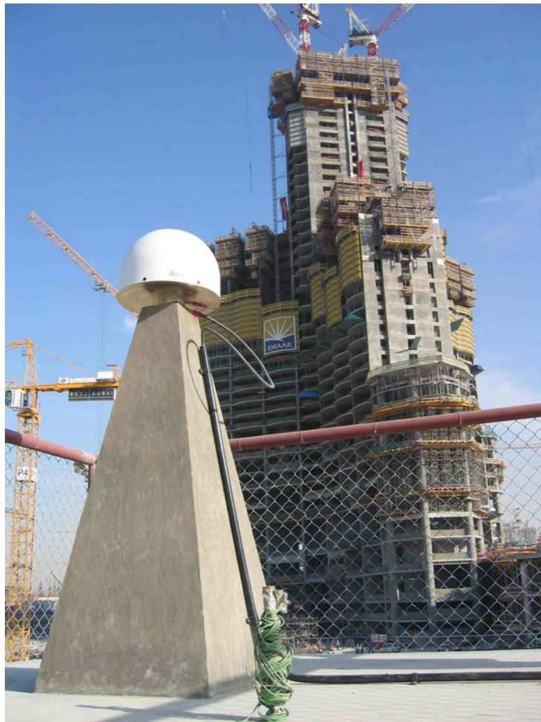
Figure 2: Continuous Operating Reference Station

Operating GPS Reference Station Leica GPS GRX1200 Pro with AT504 chokering antenna and Leica GPS Spider software, using Leica Geo Office software (LGO).