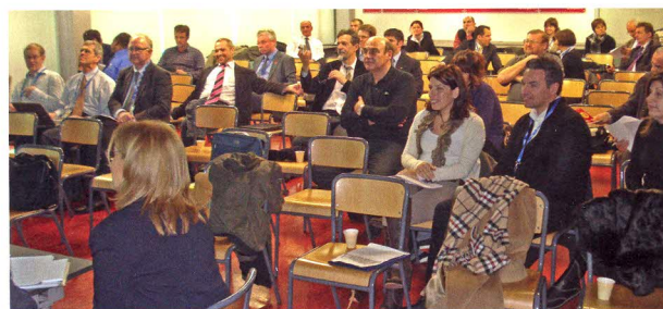
Commission 3 delegates during the workshop