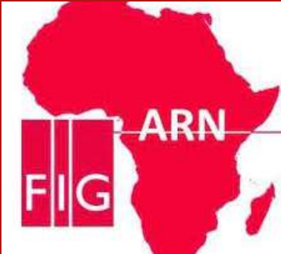
FIG-AFRICA REGIONAL NETWORK WORKPLAN PROPOSAL 2023-2026

FIG- Africa Regional Capacity Development Network