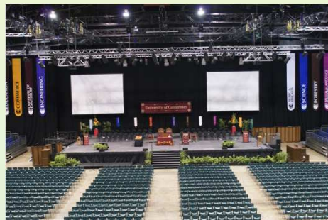
FIG 2016 Working Week will be held at CBS Canterbury Arena and Addington Raceway.