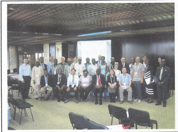
Conference participants at technical session TS04A – Hydrographic Solutions

The four dedicated sessions, which were both informative and generally well supported, encompassed a broad selection of hydrography-related subjects. Presentations included topics as diverse as the importance of having a hydrographic surveying capability in developing an internal waterways transportation system in Ghana, wetland management for the Ikorodu Local Government Area in Lagos, Nigeria, and water-induced soil erosion modelling for medium watersheds in Yen Bai province, Vietnam, to more general areas of interest in relation to coastal risk analysis of areas around the Black Sea due to rises in sea levels,