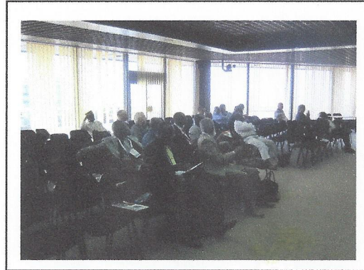
Hydrography technical session TS06A – Marine and Cadastral Management

In summary, HCNC participation in FIG Working Week 2015 achieved its desired objectives in terms of networking, hydrographic community engagement, and obtaining endorsement of the WG 4.1 Work Plan for 2015-2018. There is no doubt of the relevance of WG 4.1 and that the reviewing aspects of standards and guidelines within Commission 4 need reinvigoration; it is in the interests of stakeholder organisations, beneficiaries and the wider hydrographic community that there be some contribution to the standards process. It is important there also be broad, coordinated representation to the HSSC and the IBSC on hydrographic survey standards and guidelines as and when required, particularly when such standards and guidelines come up for periodic review. While there are certainly issues involved in realising this through WG 4.1 and to have WG 4.1 accepted as part of the review process, such challenges are by no means insurmountable.