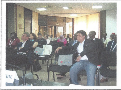
International participation in technical session TS07A – Issues in Hydrography