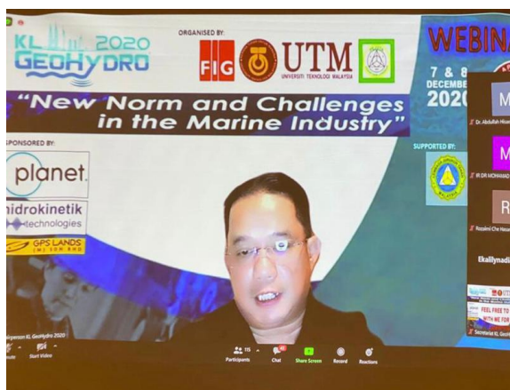
Figure 2: Speech by the Chair of Working Group 4.4 at KL GeoHydro 2020