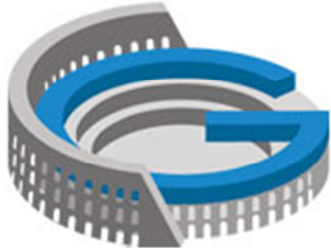
FIG WORKING WEEK 2012