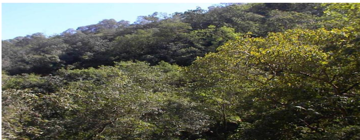
Recovery of forest around Filfil-

Eye witness observations of the area confirm that stability has allowed natural habitat to gradually recover. It appears that forest BD is on the right track, and the 'naturalness' of the area is on recovery. This is encouraging in terms of forest recovery, wildlife growth and mitigation of soil erosion and land degradation. But this has to be certified in terms of statistics. Success of any development programme is measured in terms of set-out criteria. The indicators of success for BD conservation could include a wide-range of tools such as the status of wildlife species, tree species, diversity and coverage, soil and water quality and quantity, lifestyle of local people, access to health, education, safe water, etc.