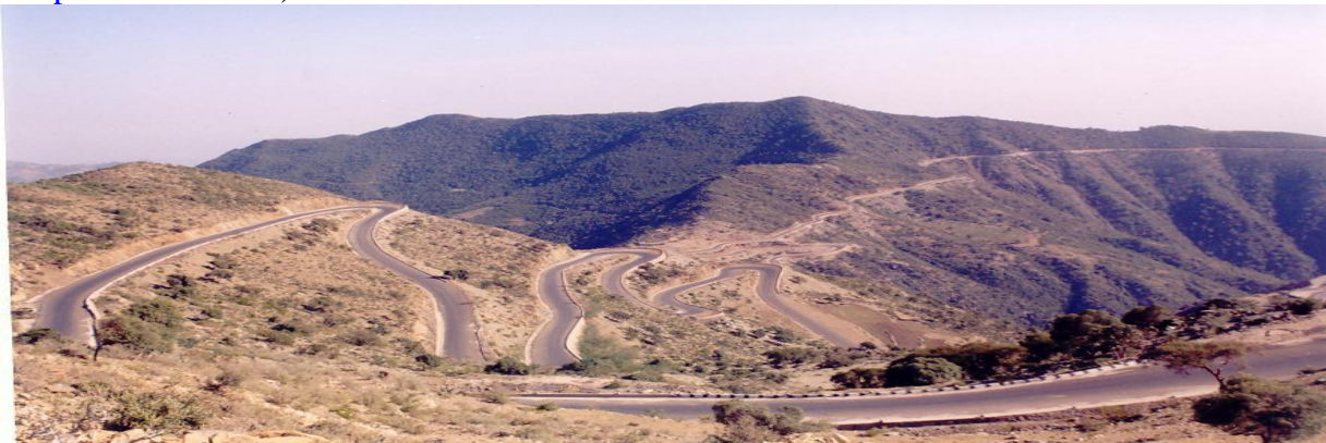
Asmara-Massawa Road passing through the National Park (Adapted from the Department of Environment, 2015)

The location of the Green Belt area is suitable for ecotourism. The spectacular land scenery is stunning beautiful with diverse fauna and flora. The area is ‘outstanding spot for bird-watching’, referred as ‘paradise on earth’ ( www.shabait.com/about-eritrea/erina/15254-the-potentials-for-tourism-development-in-eritrea ). It has impressive weather with low lying summer fogs, landscape and sceneries, hot springs, diverse cultures and traditions of ethnic groups. The beautiful scenery, wildlife, peace and security, hospitality and generosity of the people, etc. make the area suitable for ecotourism development ( www.shabait.com/about-eritrea/erina/15254-the-potentials-for-tourism-development-in-eritrea ).